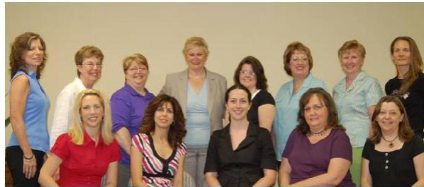
The ALC Today - Practitioners & Staff